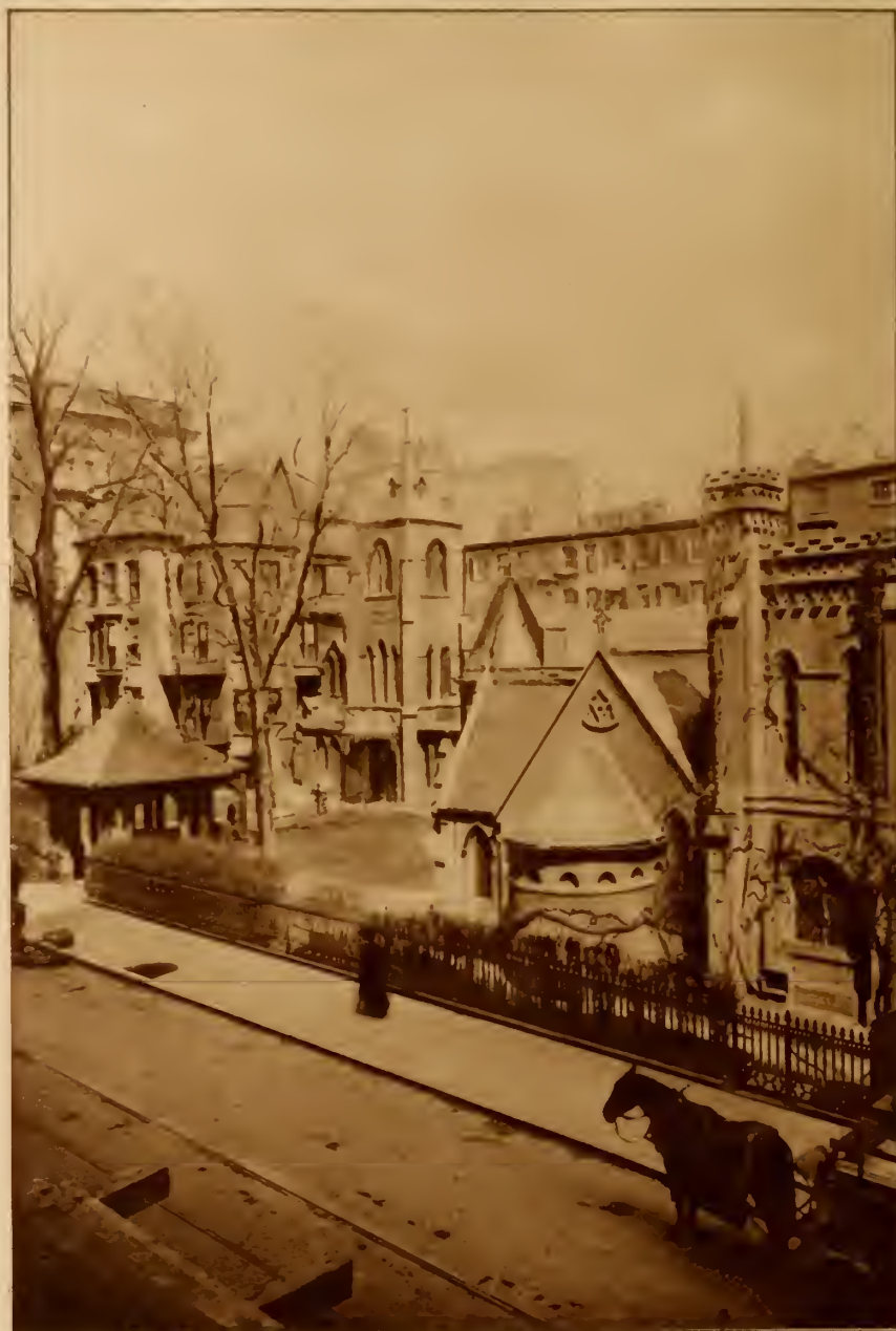
CHURCH OF THE TRANSFIGURATION at 29th Street near 5th Avenue, known as the Little Church Around The Corner, and frequented by the dramatic profession.